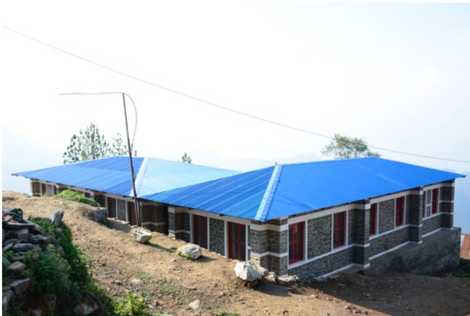
School opening in Bhorle/Rasuwa, on May 14th, 2016.

Regrettably, the opening found no interest at the governmental schools authority.