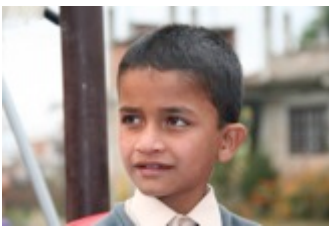
Pasrakash (picture of 2011): GCE (A-levels), studying with support of the family at his own expense